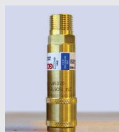
Oxygen flash-back arrestor