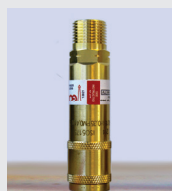
Acetylene quick-fit flash-back arrestor

It is recommended that flash-back arrestors are tested for leaks and safety at least once per year for CP7 regulations.